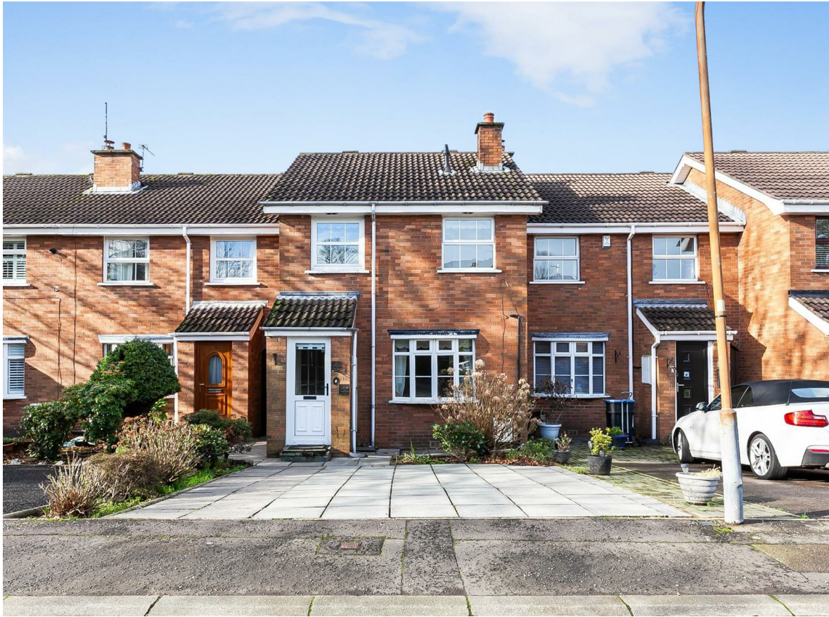
8 Somerton Court, Belfast, BT15 3LQ